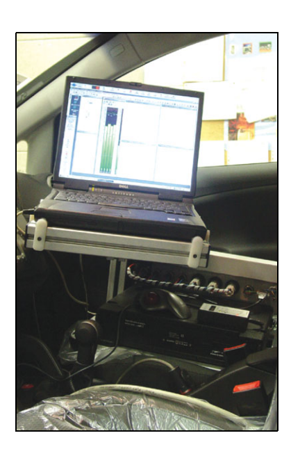
Fig. 3 The laptop PC is held in a specially constructed fixture – the driver can easily see the screen while driving on the test track. Remote Control ZH 0630 enables the recording of data to be started, stopped and saved