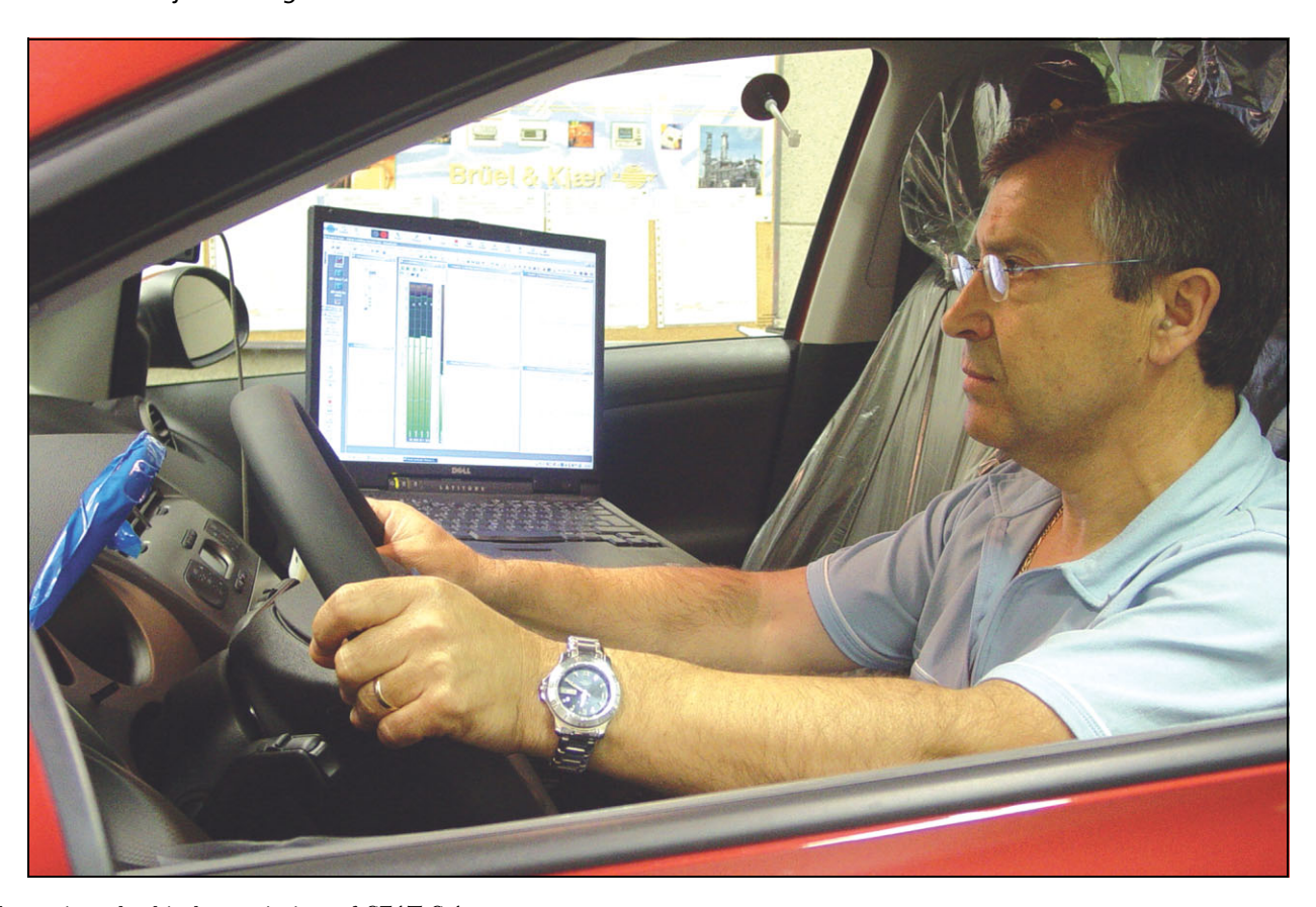
Illustrations by kind permission of SEAT S.A.

© 2004 Brüel & Kjær. All rights reserved.