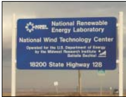
Fig. 5 The National Wind technology Center at Golden has been established for 10 years. The site provides near-perfect testing conditions – and there are not many neighbours!

To determine the noise characteristic of a turbine, it is necessary to place the microphones at a number of different positions and to also measure the main operating parameters.