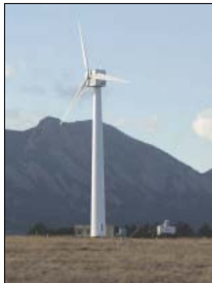
Fig. 4 A three-blade 100 kW turbine generator at NREL's facility. This configuration runs into wind and tends to be quieter than designs using two blades

The National Wind Technology Center recently purchased a 6/1-channel Portable PULSE system for general NVH analysis and investigations into turbine noise with respect to noise legislation. Before the acquisition of PULSE, noise data was stored on a DAT recorder and post-processing analysis was subsequently carried out in the laboratory.