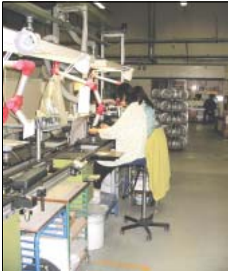
Fig. 9 One of the production lines at Peerless' facility at Karlslunde

“SoundCheck™ was developed, exactly for this type of application, in the US by Listen Inc., formed by Steve Temme. Steve has been associated with Brüel & Kjær for many years, and has developed this versatile, software-based system for the production line testing of electroacoustic devices. SoundCheck™ runs under Windows® and comprises a series of ‘Virtual Instruments’. This means that no special hardware is required as the system operates using a standard professional sound card (supplied with the system) and a PC equipped with a Pentium® processor. SoundCheck™ performs very rapid frequency and phase response, impedance and distortion tests in one sweep, typically in less than five seconds.