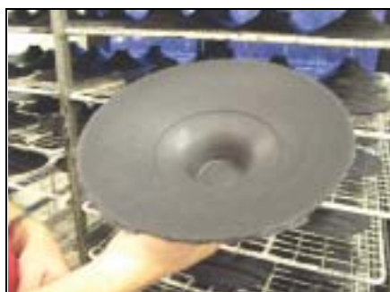
Fig. 7 A finished paper cone. The formulations of the paper-based material are a closely guarded secret

“Then the cone is air dried in an oven, and impregnated to make it water proof and to obtain the right stiffness and damping. But we never press the material, thus avoiding spoiling the fibre structure of the paper. Practically all other paper cones in the world are pressed wet. Finally, the cones are punched to the right size, the surround is mounted, and now it’s ready for use in our production.”