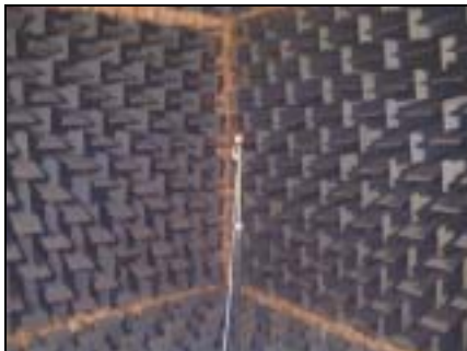
Fig. 5 The anechoic test chamber is triangular. No two surfaces are parallel, thus ensuring a reduction in standing waves. A Brüel & Kjær ½" Microphone Type 4191 is used for measurement

A Laser Velocity Transducer Type 8323 is used to measure the velocity of a loudspeaker's diaphragm, to calculate the Thiele and Small parameters.