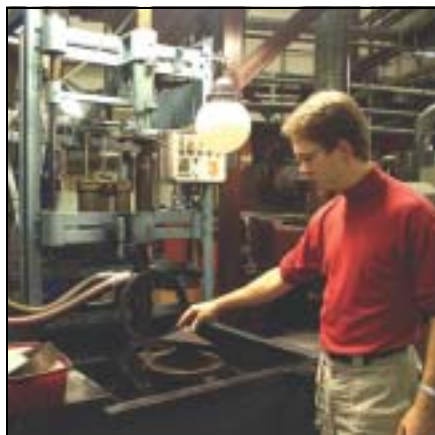
Fig. 6 Peerless' speciality is manufacturing its own cones. The in-house manufacturing facility is unique in Denmark

He continues, “Our paper cone production is unique in Denmark. We are the only company making cones from raw material directly imported from large Swedish paper manufacturers. All other Danish paper producing factories use recycled material”.