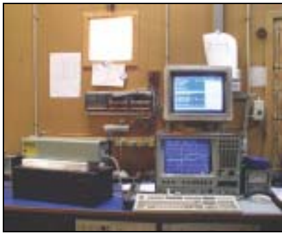
Fig. 4 Peerless' lab uses Brüel & Kjær Audio Analyzer Type 2012. The unit on the right is Laser Velocity Transducer Type 8323, used to measure the velocity of a loudspeaker's diaphragm

Knud says, “Our relationship with Brüel & Kjær goes back around 50 years. We already had some of their products when I joined Peerless in 1956. We use an Audio Analyzer Type 2012 in our R&D laboratory. We have had this since 1991 – in fact I believe we were one of the first customers. It is completely reliable, accurate and does everything we need. We feel very safe with it. All the instrumentation microphones used in the lab and in production are from Brüel & Kjær”.