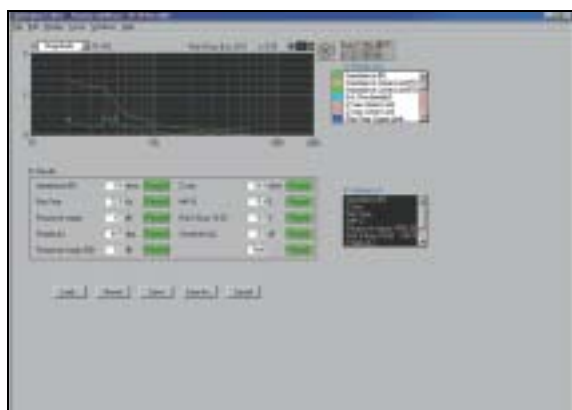
Fig. 8 PASS/FAIL criteria are easily set or changed and status is shown clearly after each test. The display also shows that individual test parameters are within the defined tolerances

Carsten adds, “The production line test staff are not acoustics experts. The SoundCheck™ user interface is very simple and shows a PASS/FAIL indication. A graph is also displayed. In the event of a loudspeaker failing the test, this indicates the probable cause of the problem and our production staff become experienced in fault diagnosis and classification. Analysis of the test data also shows where problems with rub and buzz occur. It’s a very useful tool for production line management”.