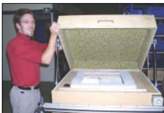
Fig. 3 A special test chamber has been developed for testing Peerless' range of flat loudspeakers using SoundCheck™ Electroacoustic Test Systems for quality control

Carsten explains, "The exceptional benefit of flat speakers using NXT technology is the very clear reproduction of speech. They don't move air like a piston but each point moves. They are not directive. Of course they can also be used for music, but speech is their real forté. Because the speakers are flat, they can be easily hidden – perhaps combined with a lamp – and therefore appeal to architects".