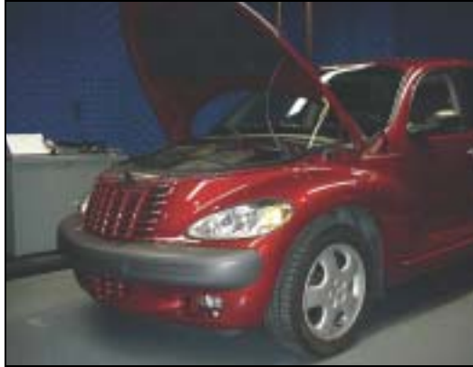
Fig. 2 The NVH characteristics of a car's electric fuel pump are analysed in the hemi- anechoic chamber

The NVH test laboratory at Caro was built about 12 years ago. TI Automotive's policy is to continually expand and upgrade its test facilities. The hemi-anechoic room is large enough to accommodate a complete vehicle. Smaller anechoic chambers are available for testing components.