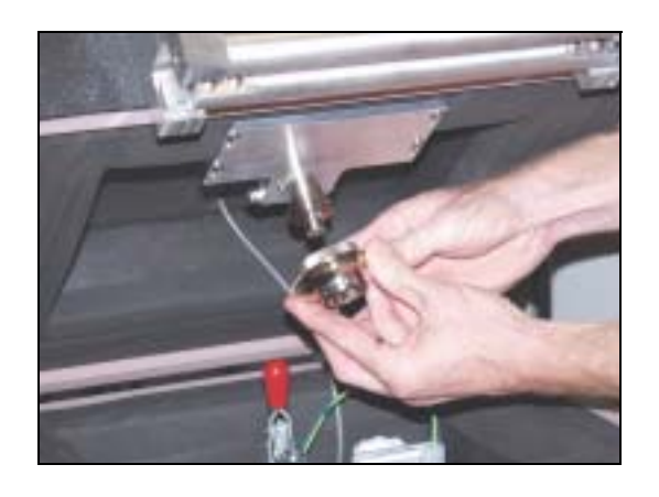
Fig. 3 A Type 4185 Ear Simulator for Telephonometry is attached to a Type 4192 Microphone in one of the test boxes

Flextronics chose the SoundCheck<sup>™</sup> system from Listen Inc. – a solution marketed worldwide by Brüel & Kjær. Bob Kunz says, "We have used Brüel & Kjær products for many years and we got excellent references on SoundCheck<sup>™</sup>. We gave the details of our testing needs to Brüel & Kjær and they quickly offered us exactly what we wanted. Our mobile phone customer was also pleased with our choice – their very specific testing demands are a path that leads right to this solution".