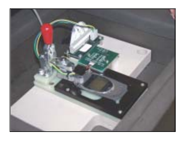
Fig. 6 A mobile phone is placed in the fixture, ready for testing

SoundCheck<sup>™</sup> has been optimised for fast production testing and evaluation, and performs very rapid frequency response and distortion tests, typically in less than 2 to 4 seconds. The system evaluates frequency response characteristics of the transducer using swept sine or noise-based tests. Harmonic distortion, and also special distortion parameters such as Rub & Buzz (an evaluation tool for poor speaker/enclosure installations) can also be measured. The number of distortion components that can be measured is practically unlimited,