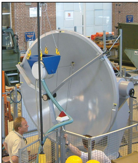
Fig. 3 Modal testing is performed using PULSE and ME'scopeVES™. The antenna is excited by a TIRA shaker

Mitchell explains, "Within my group, we carry out a variety of mechanical tests including vibration, modal analysis, shock and pyroshock testing. The test data is also used to verify mathematical modelling programmes".