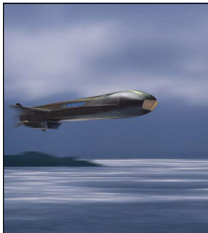
Fig. 1 KDA's new Naval Strike Missile can be deployed from ships, helicopters, aircraft and from land-based launch facilities

The Naval Strike Missile (NSM) illustrates KDA's development of advanced weapon systems. Shown on the front cover during a test firing, NSM is in development for the Royal Norwegian Navy. It is an autonomous, all-weather, terrain-following, long-range, precision standoff missile. The missile is designed to destroy high-value, well-defended targets on land and at sea.