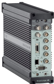
Brüel & Kjær's PULSE Front-end Type 3560-B for acoustic testing of high performance exhaust systems

HEADQUARTERS: DK-2850 Nærum · Denmark · Telephone: +45 4580 0500 Fax: +45 4580 1405 · www.bksv.com · info@bksv.com