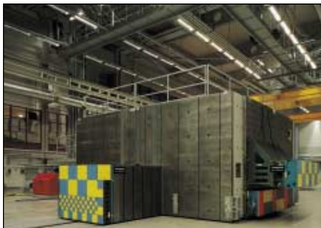
Fig. 5 The crash-test barrier weighs 800 tonnes but is easily moved to the required position on air cushions

If the safety test specifies the vehicle to be impacted against a solid barrier, sensors can be placed on the surface of the barrier and up to 128 data channels can be used. The impact data from the barrier, as well as from the vehicle itself, is then available. And the test engineers can even simulate a 50% frontal impact – like a vehicle hitting the corner of a building.