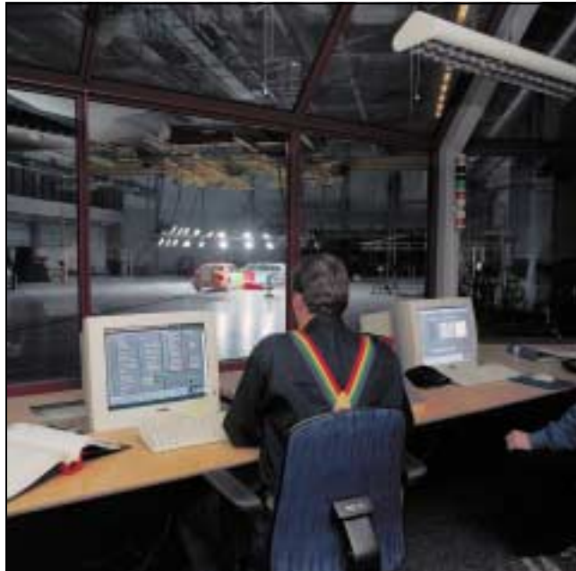
Fig. 4 The crash-test process is initiated in the control room. Here, all the data is recorded for future analysis

Patrik Settergren explains, “The test engineer specifies the test required, and the objective. The test specification covers everything from speed, acceleration, point of impact, the positioning of camera and accelerometers, all down to minute detail so that each test is repeatable. We also place marks which my colleagues call “Patrick marks” on each vehicle so that, by viewing the films, we very accurately measure the speed and distance travelled at the time of the impact”.