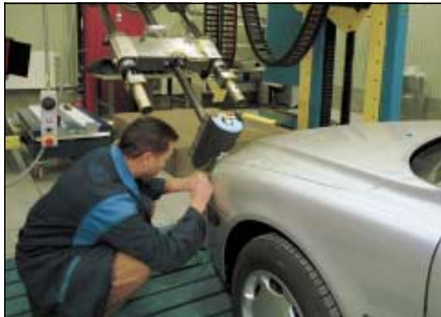
Fig. 6 A hydraulic “cannon” is used to impact samples with the size and texture of parts of the human body on to different areas of a stationary vehicle