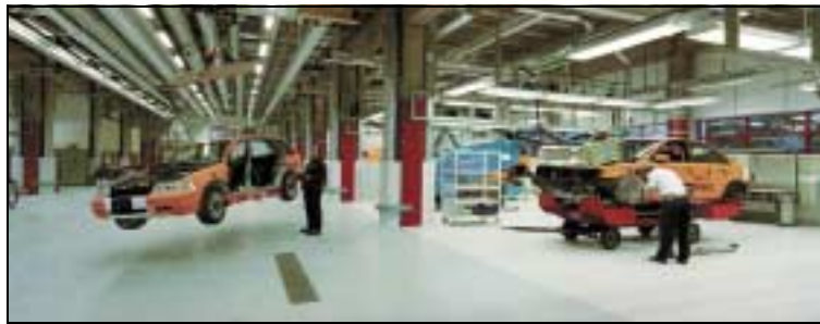
Fig. 1 It takes about 10 days to prepare each car for a full test

Patrik Settergren explains, “Each test car is a full production model, exactly as it would be seen by a customer”.