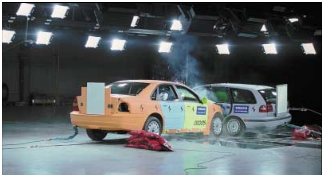
Fig. 3 At the moment of impact, digital cameras record the crash at up to 1000 frames a second. Accelerometers measure the g forces on the cars and the dummies

After a test, all the accelerometers go to Volvo’s calibrations department where they are tested to ensure that they remain within their specifications. Work is now under way to incorporate ID chips into the LEMO socket of each accelerometer. This will allow for automatic detection of the parameters of each individual accelerometer when it is connected to the data recording computer. Patrik explains, “This is a kind of TEDS (Transducer Electronic Data Sheet), and it will save a lot of setting up time”. ENDEVCO is producing a first batch of 50 of these new “smart” accelerometers for evaluation.